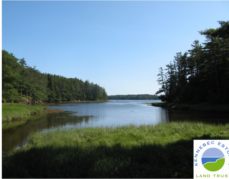
The Kennebec Estuary is a truly magnificent place, deserving respect and protection, and providing great appeal to both visitors and residents.

The Kennebec Estuary contains over 500 miles of coastline, salt marsh, and river frontage, and 20% of Maine's tidal marshes are found here—the largest concentration in the state!