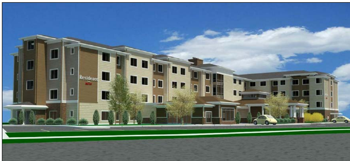
A four-story Residence Inn Marriott is scheduled to open this fall on the site of the former Holiday Inn and Bounty Restaurant site on Richardson Street.

The second Ultra Hall, located south of the original Ultra Hall, stands 110 feet tall with a pair of 200-ton bridge cranes, while the Blasting and Painting Buildings expanded to increase capacity. Demolition was completed on the South