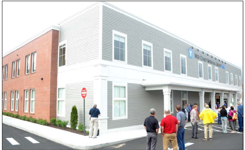
Mid Coast Medical Group's new primary care facility in downtown Bath opened for business in June.