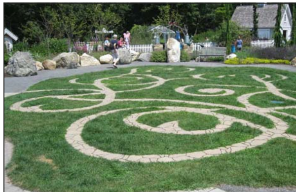
An example of games that may be included in the Guilford Lot as part of the Bath Riverwalk.