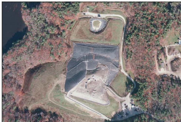
A bird's eye view of the Bath Landfill.