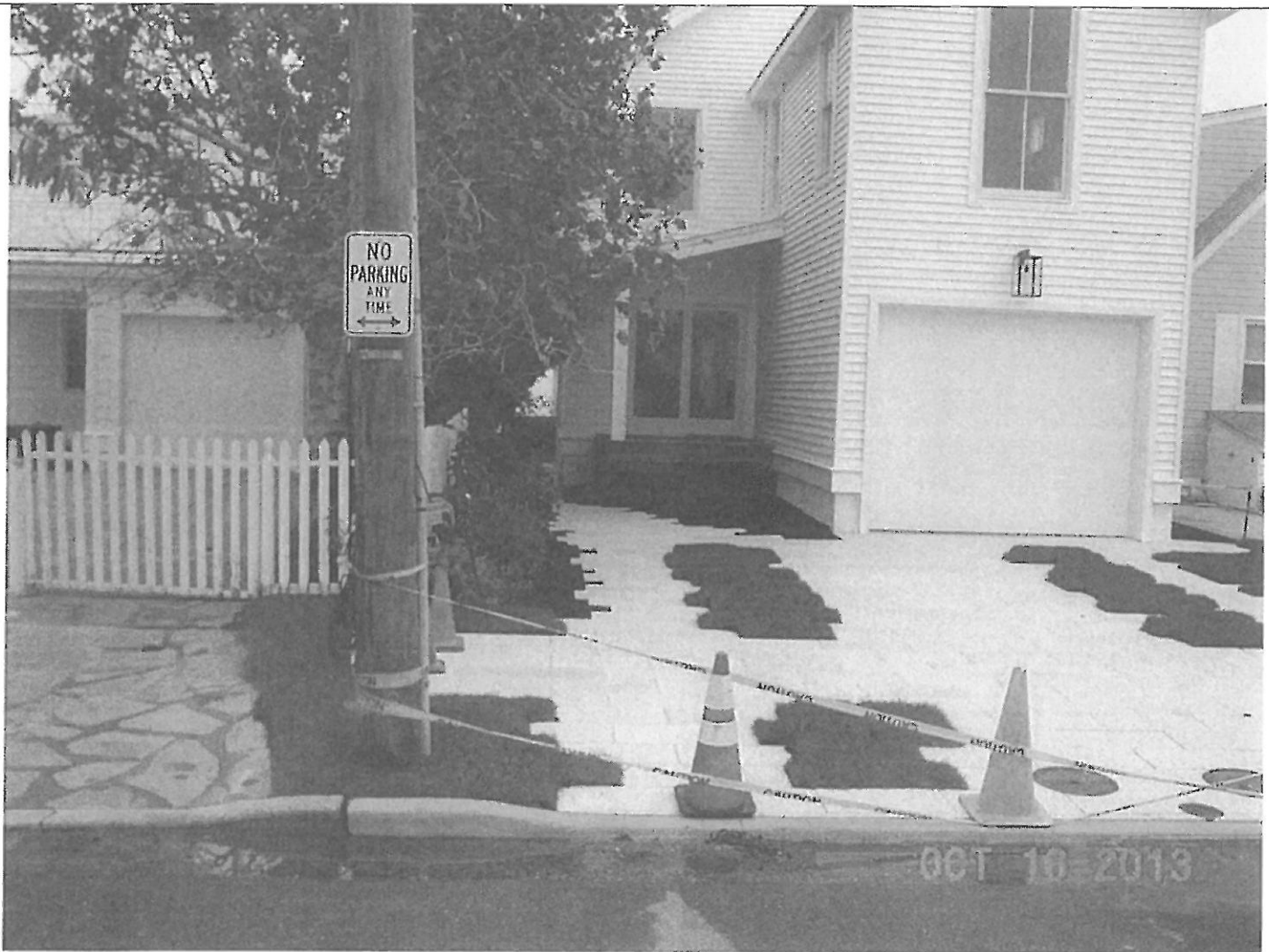
View: Front / Left Side

If using the Elevation Certificate to obtain NFIP flood insurance, affix at least 2 building photographs below according to the instructions for Item A6. Identify all photographs with date taken; "Front View" and "Rear View"; and, if required, "Right Side View" and "Left Side View." When applicable, photographs must show the foundation with representative examples of the flood openings or vents, as indicated in Section A8. If submitting more photographs than will fit on this page, use the Continuation Page.