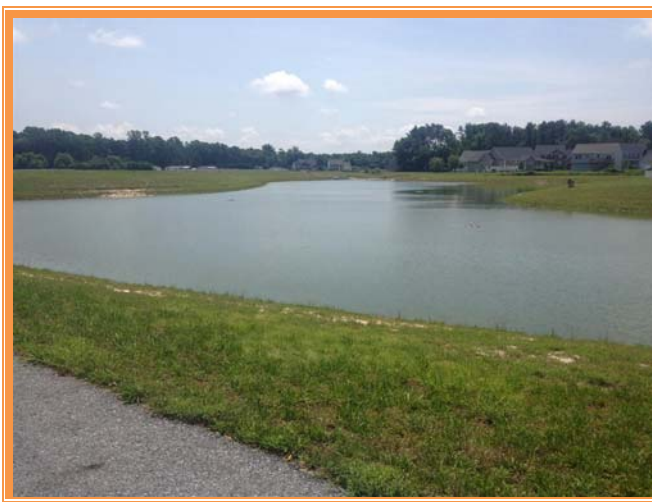
STORMWATER MAINTENANCE POND IN COUNTRY GROVE