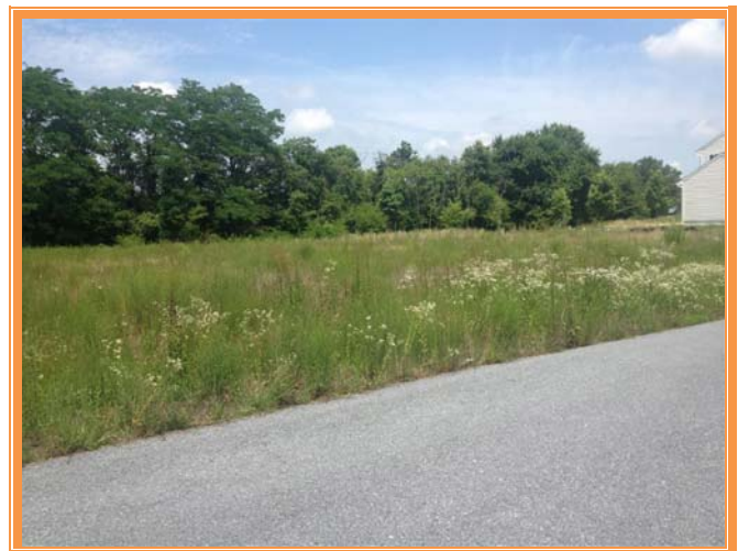
LOTS #35 AND #36 IN COUNTRY GROVE