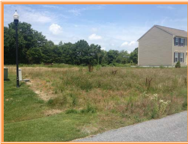
LOT #33 IN COUNTRY GROVE