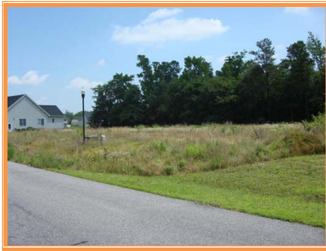
LOTS #82, #83 & #84 IN COUNTRY GROVE