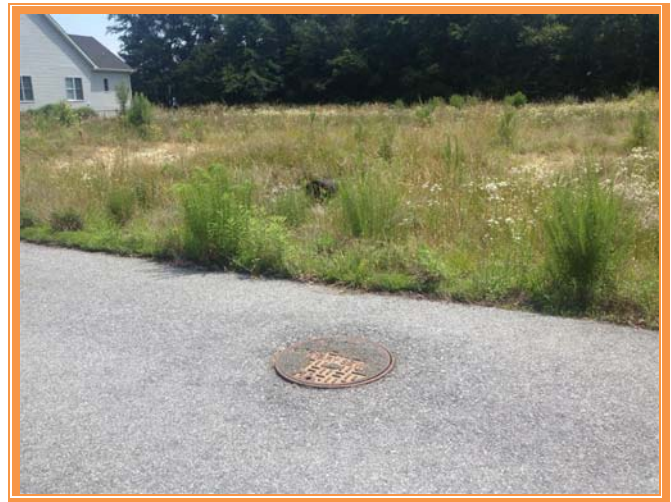
SANITARY SEWERAGE AT LOT# 83