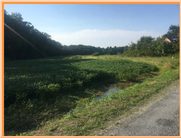
VIEW NORTHEAST ALONG WEST SIDE OF PROPERTY