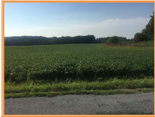
VIEW NORTHEAST ACROSS EAST END OF PROPERTY