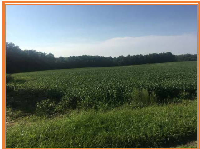
VIEW NORTH THROUGH EAST PORTION OF PROPERTY

ALL INFORMATION SUBMITTED SUBJECT TO ERRORS AND MODIFICATIONS. ALL INFORMATION CONTAINED HEREIN OBTAINED FROM RELIABLE SOURCES BUT NOT GUARANTEED. PROSPECTIVE PURCHASERS SHOULD VERIFY ALL INFORMATION SUBMITTED. LISTING BROKERAGE REPRESENTS SELLER.