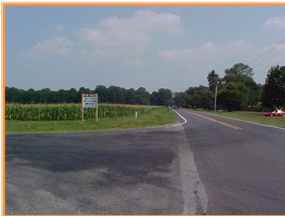
Canterbury Road Looking Southerly 913 +/- Feet Frontage