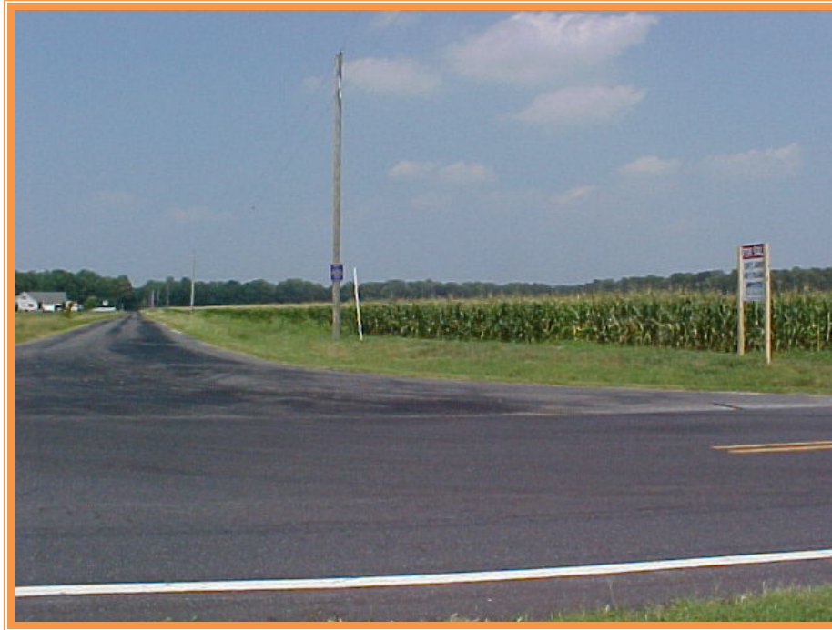
Indian Point Road Looking Easterly 1,580 +/- Feet Frontage