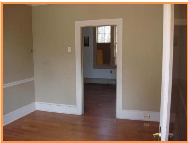
View Of Front Office From Front Door