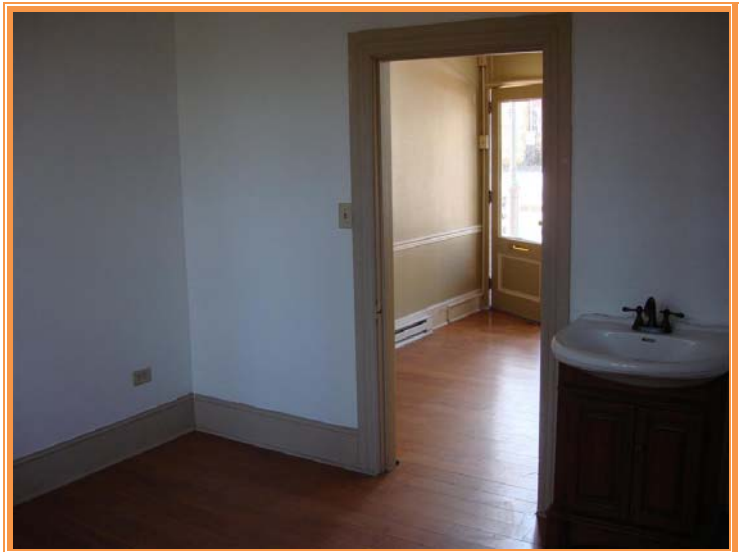
View Of Rear Office From Back Wall