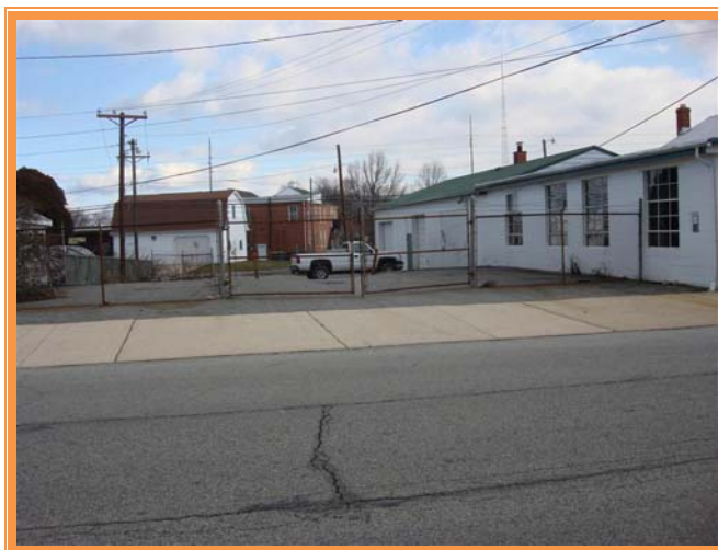
Easterly View Along North Boundary Line

ALL INFORMATION SUBMITTED SUBJECT TO ERRORS AND MODIFICATIONS. ALL INFORMATION CONTAINED HEREIN OBTAINED FROM RELIABLE SOURCES BUT NOT GUARANTEED. PROSPECTIVE PURCHASERS SHOULD VERIFY ALL INFORMATION SUBMITTED. LISTING BROKERAGE REPRESENTS SELLER * PAGE 5 OF 5 PAGES