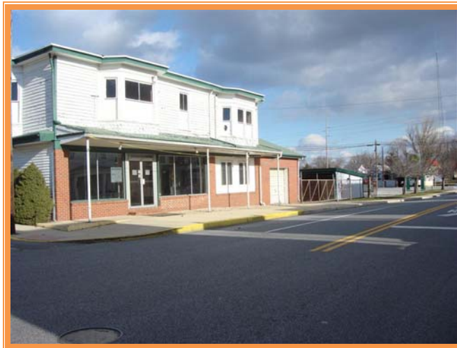
Easterly View Along Main Street