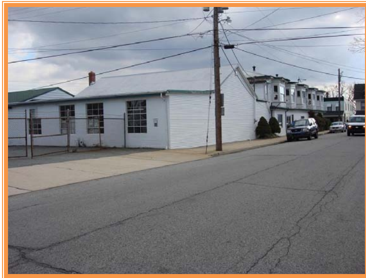
Southerly View Along Clayton Avenue

ALL INFORMATION SUBMITTED SUBJECT TO ERRORS AND MODIFICATIONS. ALL INFORMATION CONTAINED HEREIN OBTAINED FROM RELIABLE SOURCES BUT NOT GUARANTEED. PROSPECTIVE PURCHASERS SHOULD VERIFY ALL INFORMATION SUBMITTED. LISTING BROKERAGE REPRESENTS SELLER * PAGE 4 OF 5 PAGES