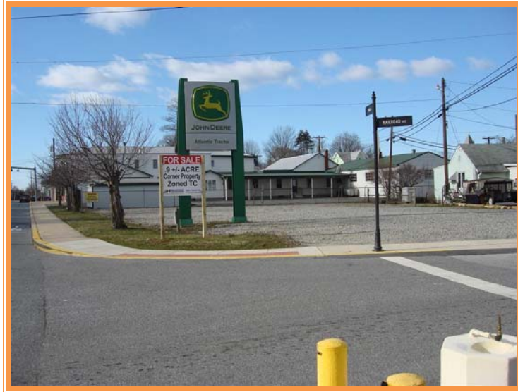
Westerly View From Delaware Street