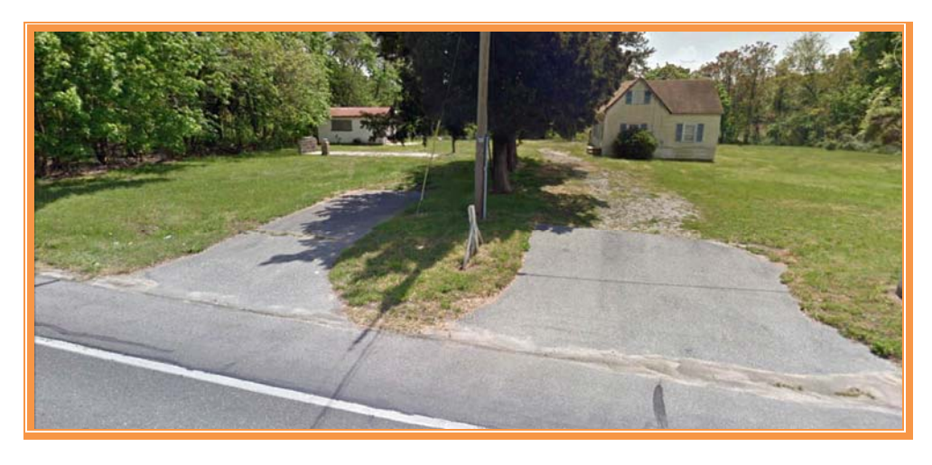
ALL INFORMATION SUBMITTED SUBJECT TO ERRORS AND MODIFICATIONS. ALL INFORMATION CONTAINED HEREIN OBTAINED FROM RELIABLE SOURCES BUT NOT GUARANTEED. PROSPECTIVE PURCHASERS SHOULD VERIFY ALL INFORMATION SUBMITTED. LISTING BROKERAGE REPRESENTS SELLER. PAGE 3 OF 4 PAGES