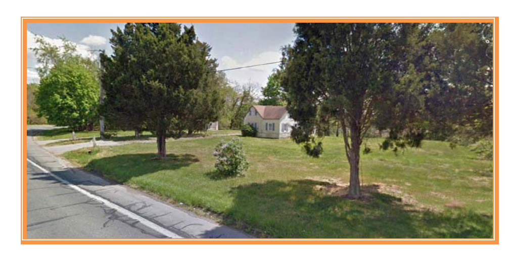
SALE PRICE $ 70,000 * $1.13 +/- PSF LAND AREA WATERFRONT LAND * 240 +/- FEET ON TIDBURY CREEK

Industrial Building Lots * On – Site utilities Required 206 +/- Feet Frontage On Sorghum Mill Road * 300 +/- Feet Average Depth 61,855 +/- Sq Ft * 1.42 +/- Acre * Clear, Level Lot