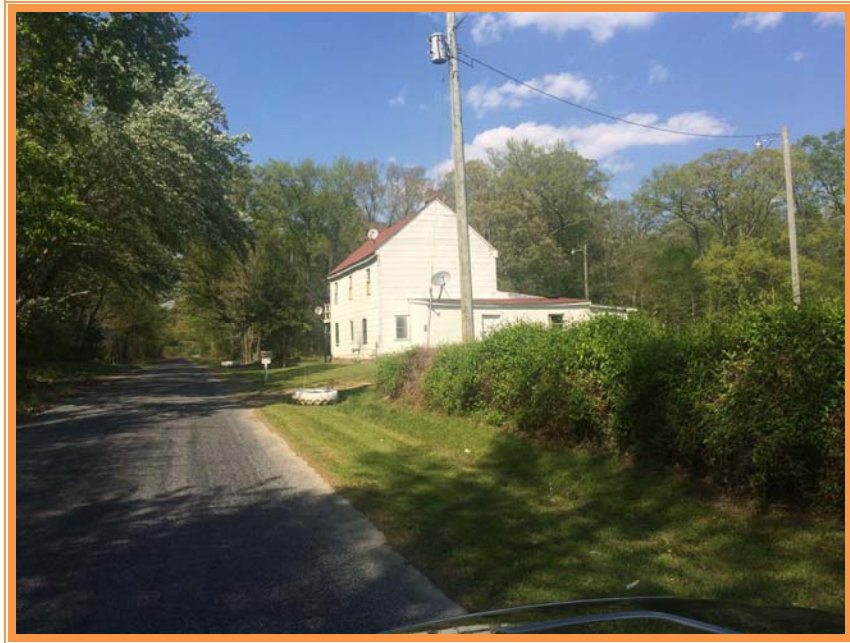
VIEW EAST TOWARDS FARMHOUSE