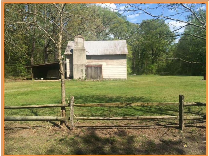
VIEW EAST TOWARD HUNTING LODGE

ALL INFORMATION SUBMITTED SUBJECT TO ERRORS AND MODIFICATIONS. ALL INFORMATION CONTAINED HEREIN OBTAINED FROM RELIABLE SOURCES BUT NOT GUARANTEED. PROSPECTIVE PURCHASERS SHOULD VERIFY ALL INFORMATION SUBMITTED. LISTING BROKERAGE REPRESENTS SELLER * PAGE 4 OF 4 PAGES