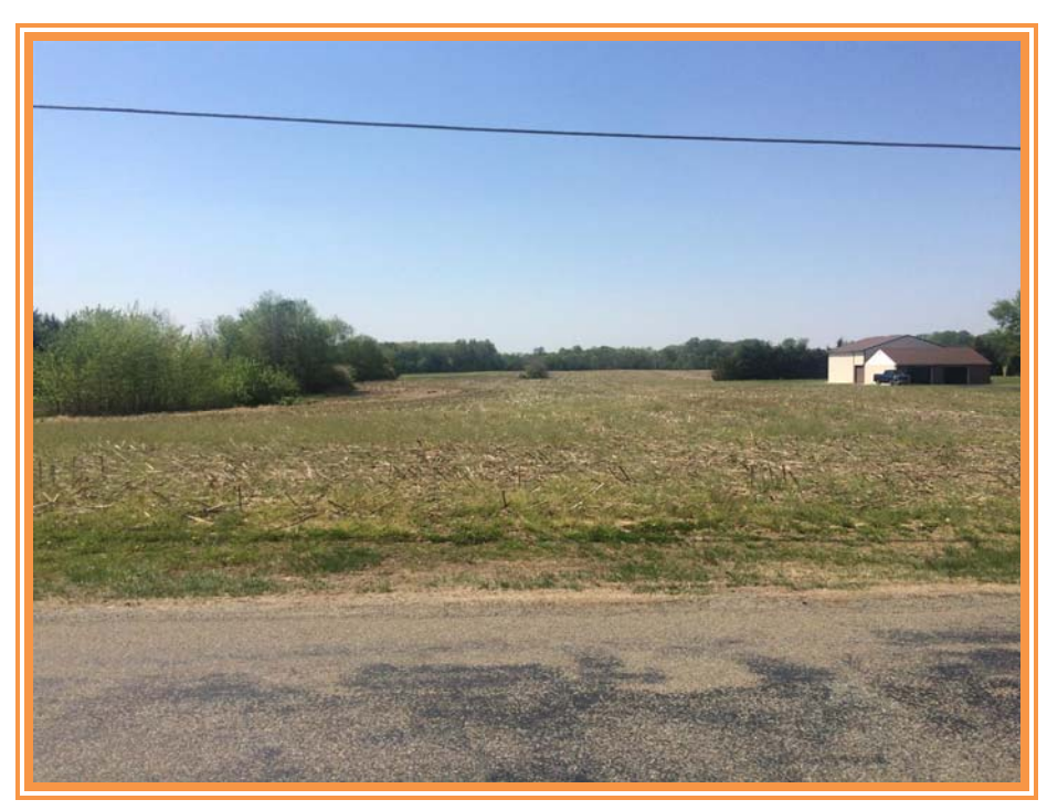
ALL INFORMATION SUBMITTED SUBJECT TO ERRORS AND MODIFICATIONS. ALL INFORMATION CONTAINED HEREIN OBTAINED FROM RELIABLE SOURCES BUT NOT GUARANTEED. PROSPECTIVE PURCHASERS SHOULD VERIFY ALL INFORMATION SUBMITTED. LISTING BROKERAGE REPRESENTS SELLER * PAGE 3 OF 4 PAGES