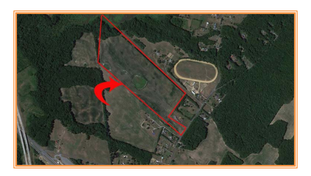
SALE PRICE $650,000 * $10,800 +/- PER ACRE LAND AREA