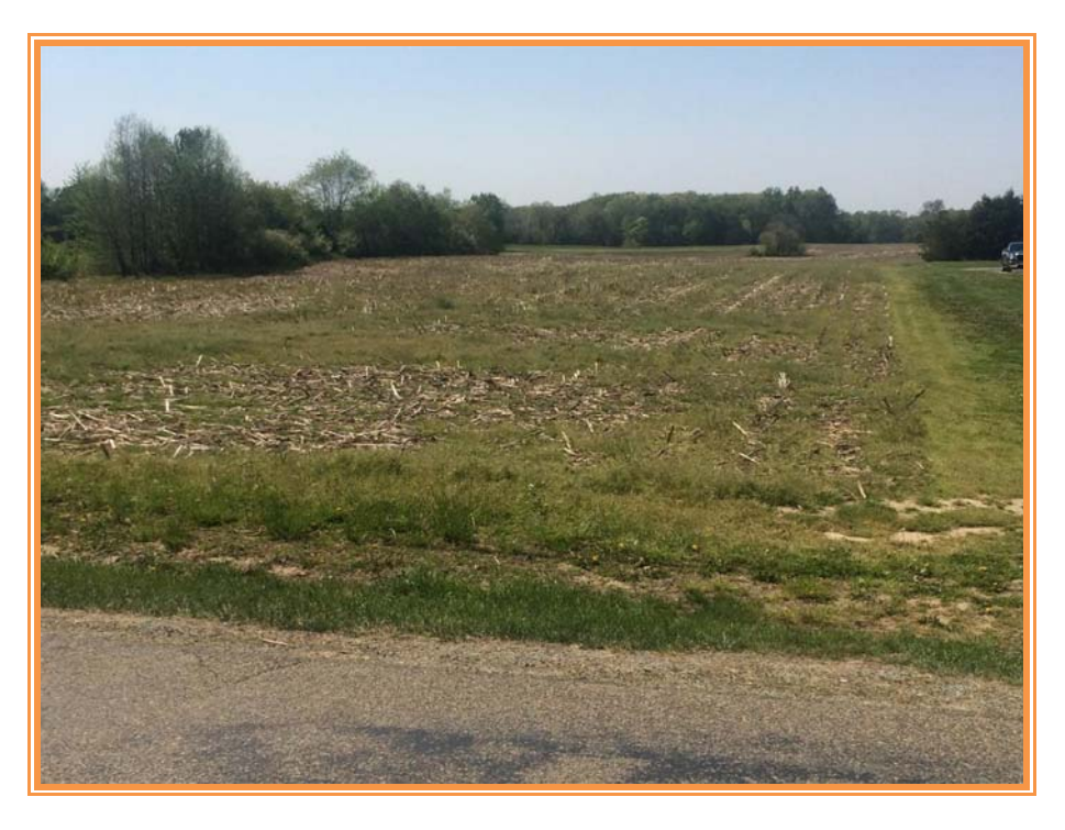
ALL INFORMATION SUBMITTED SUBJECT TO ERRORS AND MODIFICATIONS. ALL INFORMATION CONTAINED HEREIN OBTAINED FROM RELIABLE SOURCES BUT NOT GUARANTEED. PROSPECTIVE PURCHASERS SHOULD VERIFY ALL INFORMATION SUBMITTED. LISTING BROKERAGE REPRESENTS SELLER * PAGE 4 OF 4 PAGES