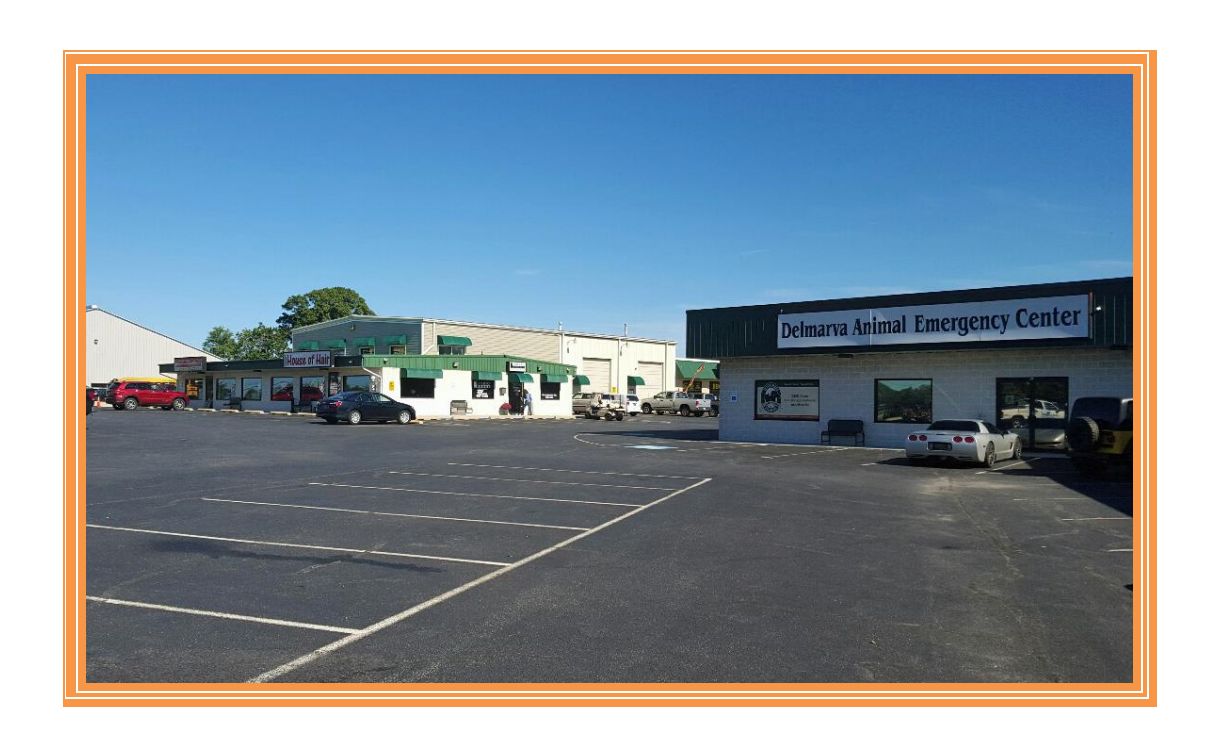
VIEW FACING WEST