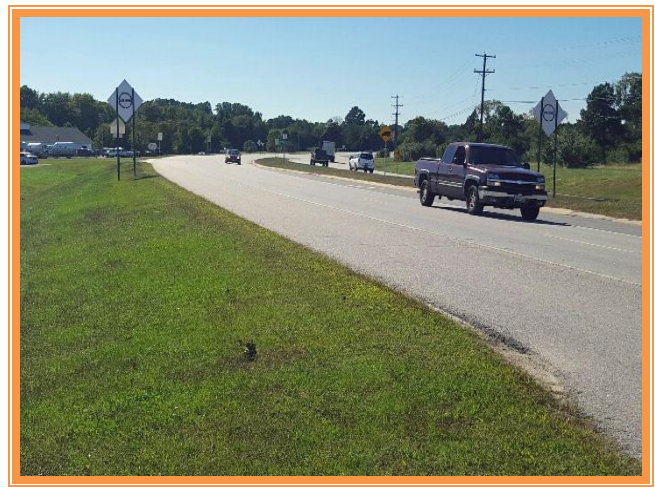
VIEW FACING WEST