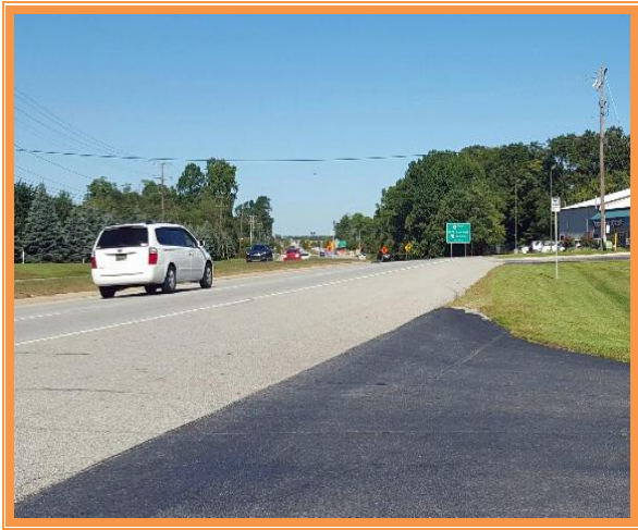
VIEW FACING EAST