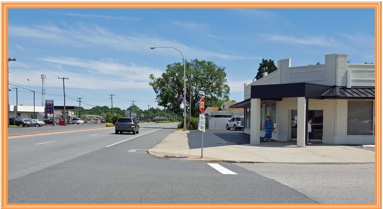
VIEW OF SUITE ENTRANCE LOOKING SOUTH

ALL INFORMATION SUBMITTED SUBJECT TO ERRORS AND MODIFICATIONS. ALL INFORMATION CONTAINED HEREIN OBTAINED FROM RELIABLE SOURCES BUT NOT GUARANTEED. PROSPECTIVE PURCHASERS SHOULD VERIFY ALL INFORMATION SUBMITTED. LISTING BROKERAGE REPRESENTS SELLER. PAGE 3 OF 4 PAGES