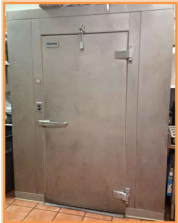
ONE OF THREE WALK IN'S