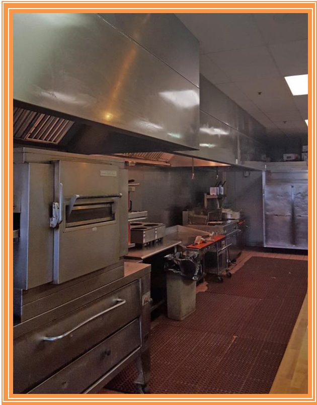
VIEW OF KITCHEN