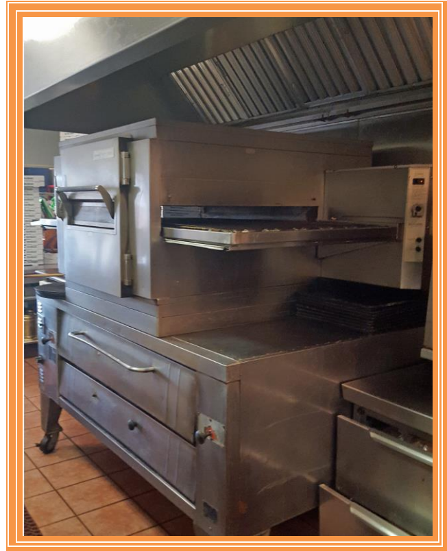
PIZZA OVEN AND CONVEYOR

ALL INFORMATION SUBMITTED SUBJECT TO ERRORS AND MODIFICATIONS. ALL INFORMATION CONTAINED HEREIN OBTAINED FROM RELIABLE SOURCES BUT NOT GUARANTEED. PROSPECTIVE PURCHASERS SHOULD VERIFY ALL INFORMATION SUBMITTED. LISTING BROKERAGE REPRESENTS SELLER. PAGE 2 OF 3 PAGES