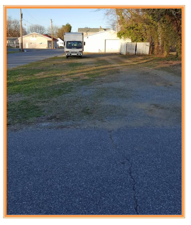
VIEW OF ATTACHED YARD