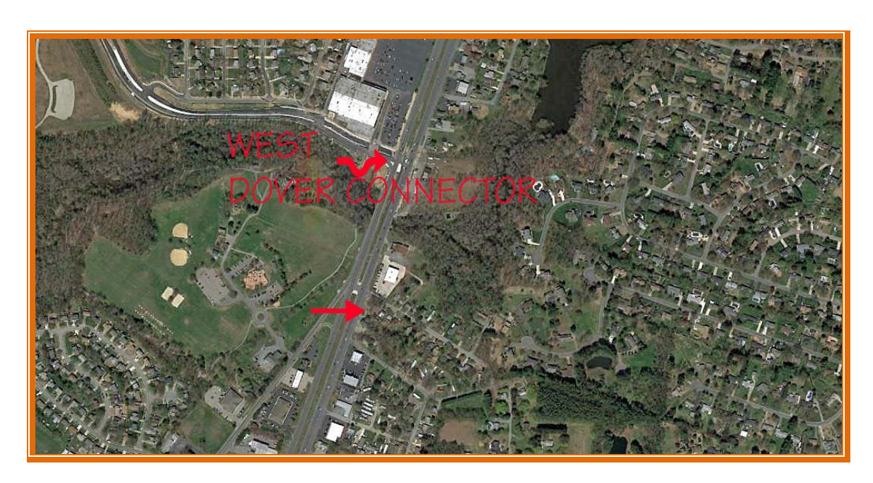
SALE PRICE $ 675,000 * $ 9 +/- PER SQUARE FOOT * $400,000 +/- PER ACRE