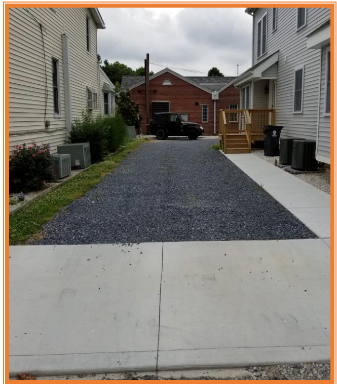
MARKET STREET ENTRANCE