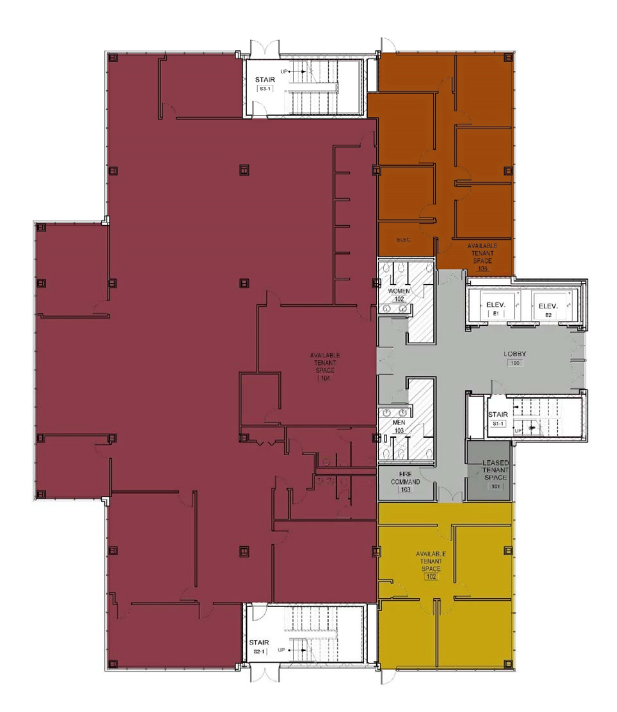
1 FIRST FLOOR PLAN - BOMA