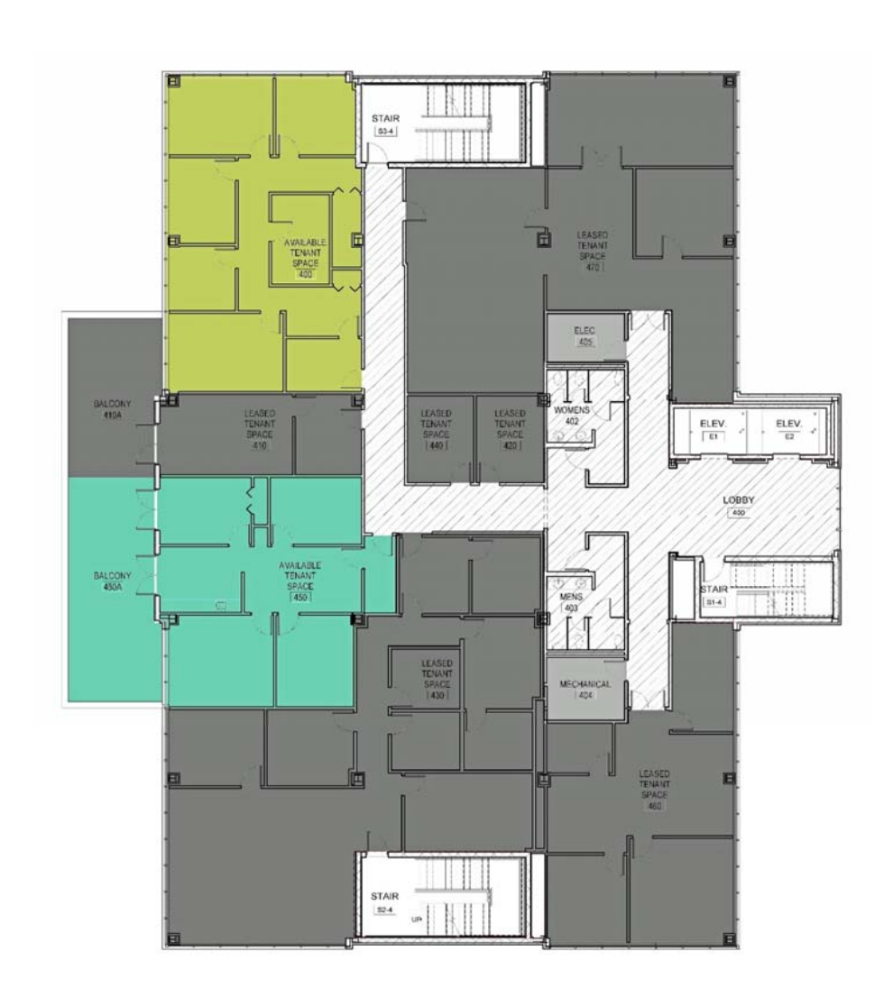
1) FOURTH FLOOR PLAN - BOMA SCALE: 185" = 1"-0"