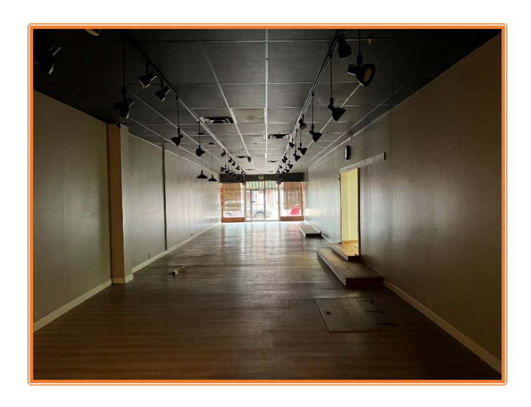
ALL INFORMATION SUBMITTED SUBJECT TO ERRORS AND MODIFICATIONS. ALL INFORMATION CONTAINED HEREIN OBTAINED FROM RELIABLE SOURCES BUT NOT GUARANTEED. PROSPECTIVE PURCHASERS SHOULD VERIFY ALL INFORMATION SUBMITTED. LISTING BROKERAGE REPRESENTS SELLER. PAGE 5 OF 5 PAGES