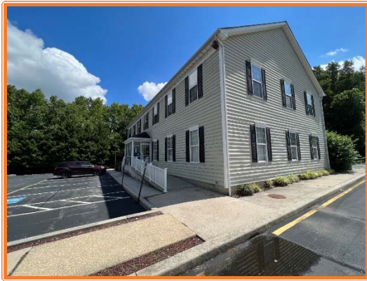
EXTERIOR VIEW ADA RAMP TO FRONT ENTRY