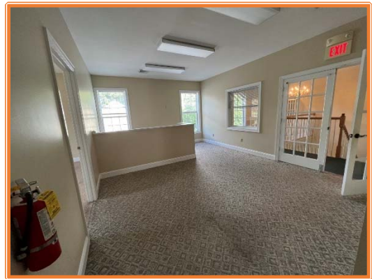
INTERIOR VIEW SECOND FLOOR RECEPTION AREA