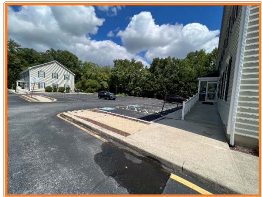
EXTERIOR VIEW ADA RAMP AND PARKING LOT