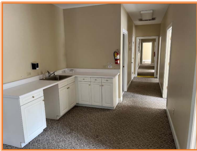
INTERIOR VIEW SECOND FLOOR KITCHEN