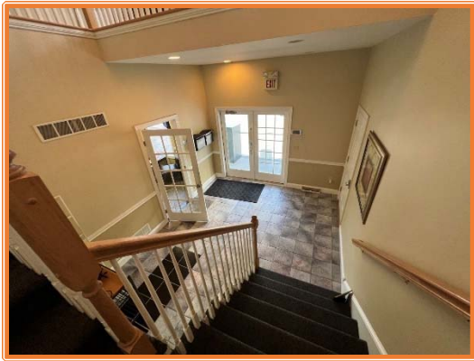
INTERIOR VIEW FIRST FLOOR LOBBY AND STAIRS DOWN