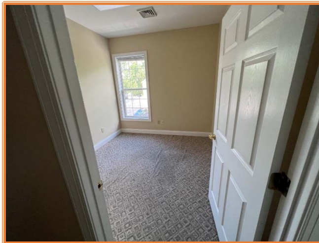
INTERIOR VIEW TYPICAL OFFICE AREA

ALL INFORMATION SUBMITTED SUBJECT TO ERRORS AND MODIFICATIONS. ALL INFORMATION CONTAINED HEREIN OBTAINED FROM RELIABLE SOURCES BUT NOT GUARANTEED. PROSPECTIVE PURCHASERS SHOULD VERIFY ALL INFORMATION SUBMITTED. LISTING BROKERAGE REPRESENTS SELLER * PAGE 6 OF 6 PAGES