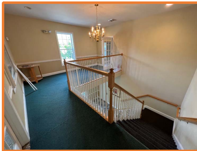
INTERIOR SECOND FLOOR LANDING AREA

ALL INFORMATION SUBMITTED SUBJECT TO ERRORS AND MODIFICATIONS. ALL INFORMATION CONTAINED HEREIN OBTAINED FROM RELIABLE SOURCES BUT NOT GUARANTEED. PROSPECTIVE PURCHASERS SHOULD VERIFY ALL INFORMATION SUBMITTED. LISTING BROKERAGE REPRESENTS SELLER * PAGE 5 OF 6 PAGES