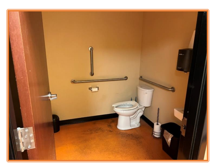
ALL INFORMATION SUBMITTED SUBJECT TO ERRORS AND MODIFICATIONS. ALL INFORMATION CONTAINED HEREIN OBTAINED FROM RELIABLE SOURCES BUT NOT GUARANTEED. PROSPECTIVE PURCHASERS SHOULD VERIFY ALL INFORMATION SUBMITTED. LISTING BROKERAGE REPRESENTS SELLER * PAGE 5 OF 5 PAGES