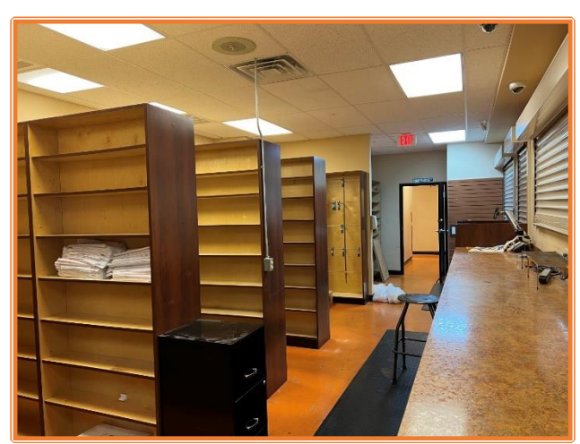
ALL INFORMATION SUBMITTED SUBJECT TO ERRORS AND MODIFICATIONS. ALL INFORMATION CONTAINED HEREIN OBTAINED FROM RELIABLE SOURCES BUT NOT GUARANTEED. PROSPECTIVE PURCHASERS SHOULD VERIFY ALL INFORMATION SUBMITTED. LISTING BROKERAGE REPRESENTS SELLER * PAGE 4 OF 5 PAGES