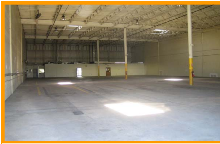
VIEW FROM DOCK DOORS