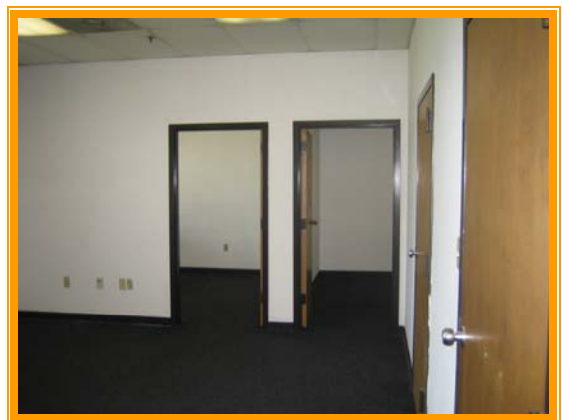
TYPICAL OFFICE SPACE