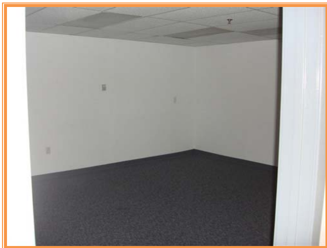
View Of Conference Room

ALL INFORMATION SUBMITTED SUBJECT TO ERRORS AND MODIFICATIONS. ALL INFORMATION CONTAINED HEREIN OBTAINED FROM RELIABLE SOURCES BUT NOT GUARANTEED. PROSPECTIVE TENANTS SHOULD VERIFY ALL INFORMATION SUBMITTED. LISTING BROKERAGE REPRESENTS LESSOR * PAGE 4 OF 4 PAGES