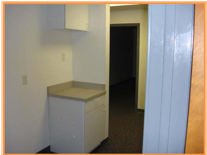
View Through Work Space To Conference Room