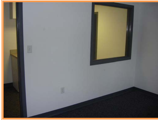
View Through Admin Office To Front Door