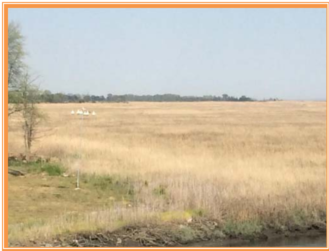
VIEW EAST THROUGH MARSH

ALL INFORMATION SUBMITTED SUBJECT TO ERRORS AND MODIFICATIONS. ALL INFORMATION CONTAINED HEREIN OBTAINED FROM RELIABLE SOURCES BUT NOT GUARANTEED. PROSPECTIVE PURCHASERS SHOULD VERIFY ALL INFORMATION SUBMITTED. LISTING BROKERAGE REPRESENTS SELLER * PAGE 3 OF 3 PAGES