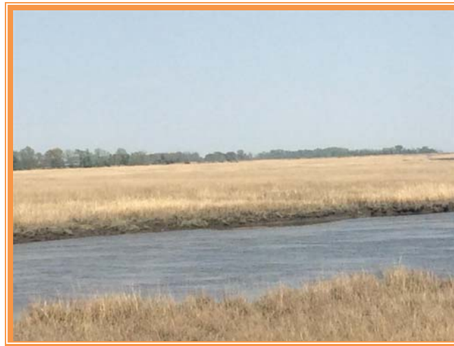
VIEW NORTHEAST ACROSS LEIPSIC RIVER