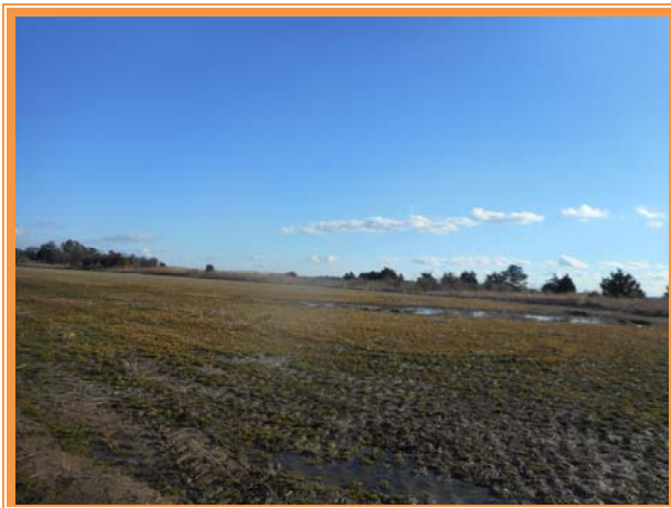
GRADE LEVEL VIEW TO EAST FROM CAINS LANDING RD