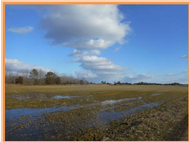
GRADE LEVEL VIEW TO SOUTH FROM CAINS LANDING ROAD