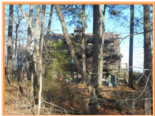
VIEW OF HUNTING LODGE

ALL INFORMATION SUBMITTED SUBJECT TO ERRORS AND MODIFICATIONS. ALL INFORMATION CONTAINED HEREIN OBTAINED FROM RELIABLE SOURCES BUT NOT GUARANTEED. PROSPECTIVE PURCHASERS SHOULD VERIFY ALL INFORMATION SUBMITTED. LISTING BROKERAGE REPRESENTS SELLER * PAGE 5 OF 5 PAGES